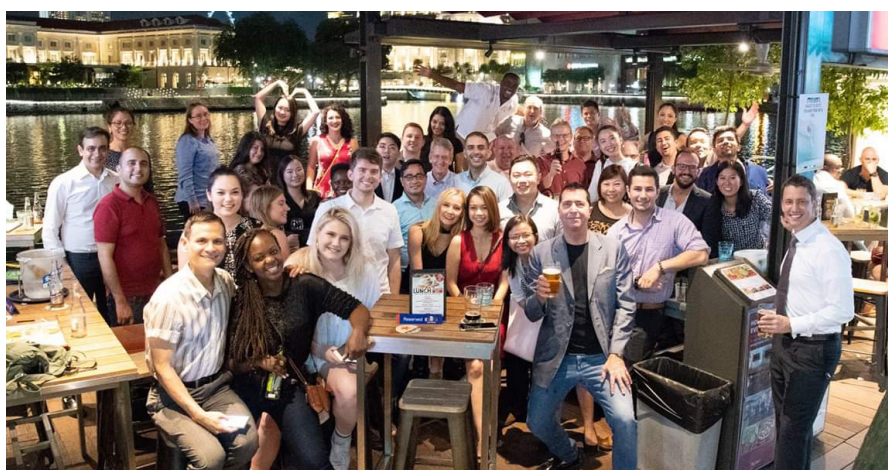
Thunderbird alumni gather together in Singapore for a T-bird First Tuesday event in 2018